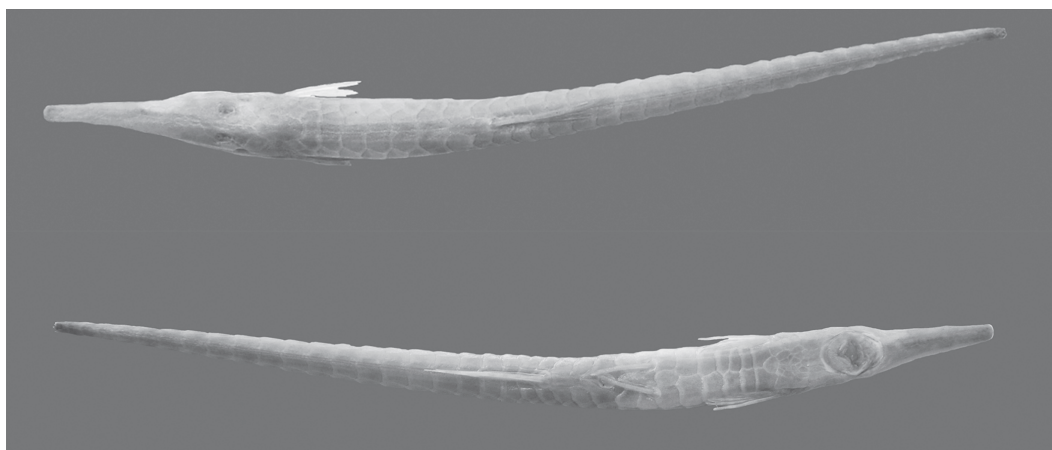
Figure 2 - Farlowella paranaense Meinken, 1937. Holotype, ZMB 33788, 132.93 mm. at top, dorsal view; at bottom, ventral view.

Museum für Naturkunde, Berlin, Germany (Koerber and Weber, 2014), the missing holotype was incidentally rediscovered. The specimen is a female, 132.93 mm SL, with a completely broken caudal fin. The characters observed in the specimen agree with those of the original description (see below).